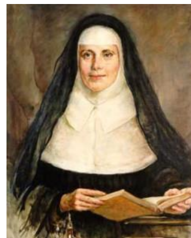
Venerable Catherine McAuley, foundress of the Sisters of Mercy